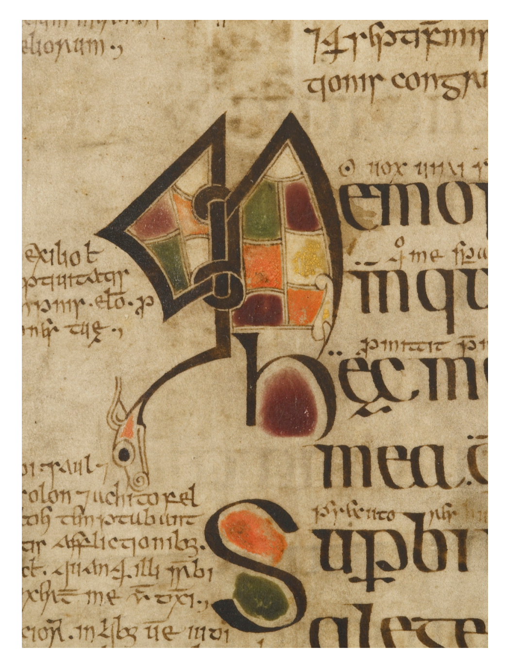
Psalter of St Caimín, MS 'A'. UCD-OFM A1, p. 5.